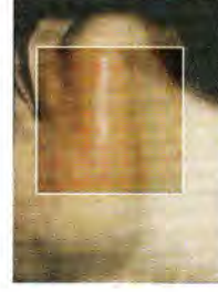
46 months post treatment